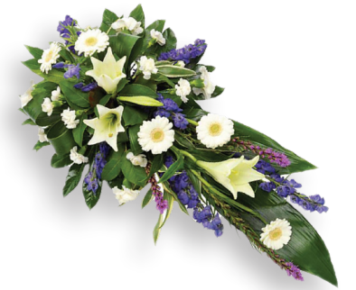
Blue & White

Standard ..... £60 Medium ..... £75 Large ..... £90