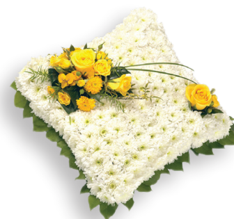
Traditional Cushion £150