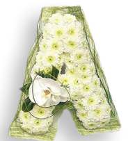
Single Letters £50