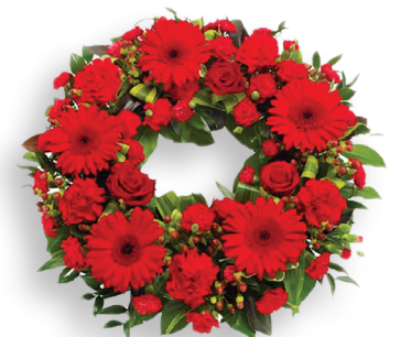
Any One Colour 10" ..... £55 12" ..... £65 14" ..... £85