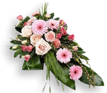
Mixed Pink Spray

Standard ..... £70 Medium ..... £80 Large ..... £90