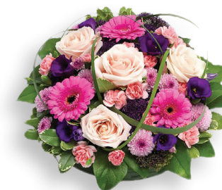
Pink Mixed Posy Standard ..... £50 Medium ..... £60 Large ..... £80