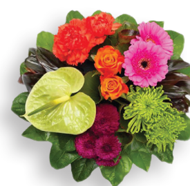
Vibrant Posy 12 Inch ..... £60 14 Inch ..... £80