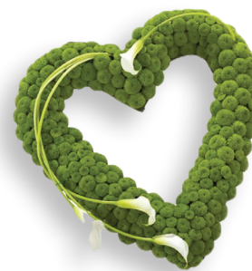
CalaLily Open Heart £160

Shaped floral tributes expressing sympathy