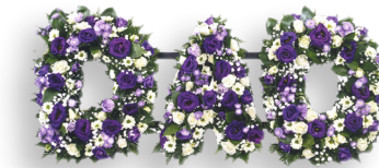
Mixed base £170