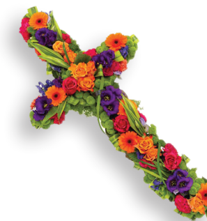
Mixed Cross 3' ..... £150 4' ..... £180 5' ..... £220