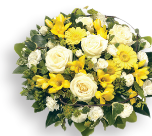
Yellow Posy Arrangement Standard ..... £50 Medium ..... £65 Large ..... £85