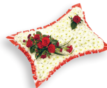
Traditional Pillow £150