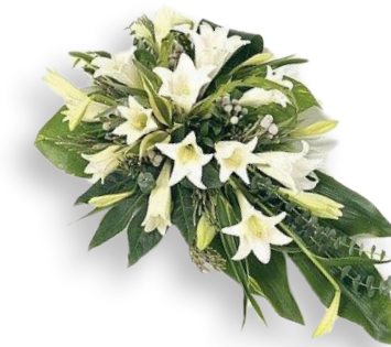
Long Lily Spray

Standard ..... £60 Medium ..... £70 Large ..... £80