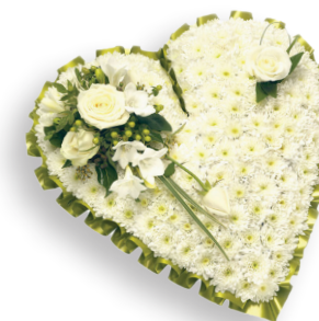
Traditional Heart £140