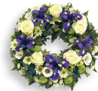
Blue & White 10" ..... £55 12" ..... £70 14" ..... £85