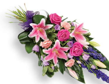
Pink & Blue

Standard ..... £65 Medium ..... £80 Large ..... £95