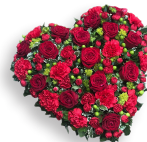
Red Heart £160