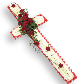
Massed Cross 3' ..... £120 4' ..... £160 5' ..... £200