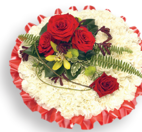
Traditional Posy Pad 12 Inch ..... £75 14 Inch ..... £90