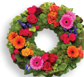
Mixed Wreath 10" ..... £65 12" ..... £85 14" ..... £100